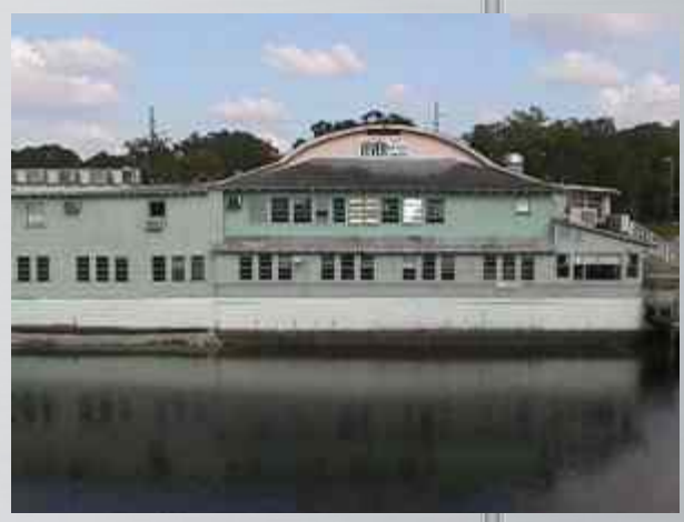
Back of the Harbor club.

The Harbor Club formerly the tourist clubhouse was founded in 1937 by a group of Michigan and Ohio tourists. It was once an all white club. Finally in 1984 membership to the tourist clubhouse fall down to 100 and the club was closed. It was renamed the Historical Harbor club which is now a restaurant. It also housed different events such as the Poetry slam or parades. What remains from the old Harbor club is this metal parking plaque entangled in the tree on which it was fixed