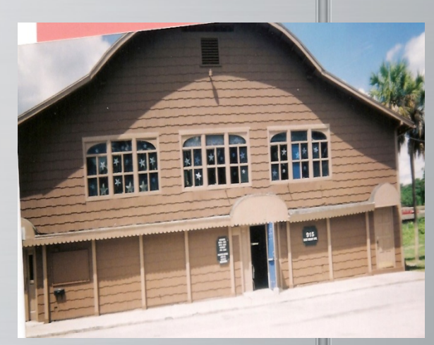
Front of the Harbor Club.

The Harbor Club formerly the tourist clubhouse was founded in 1937 by a group of Michigan and Ohio tourists. It was once an all white club. Finally in 1984 membership to the tourist clubhouse fall down to 100 and the club was closed. It was renamed the Historical Harbor club which is now a restaurant. It also housed different events such as the Poetry slam or parades. What remains from the old Harbor club is this metal parking plaque entangled in the tree on which it was fixed