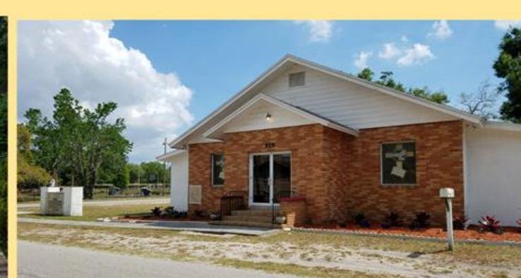
New Bethel A.M.E.