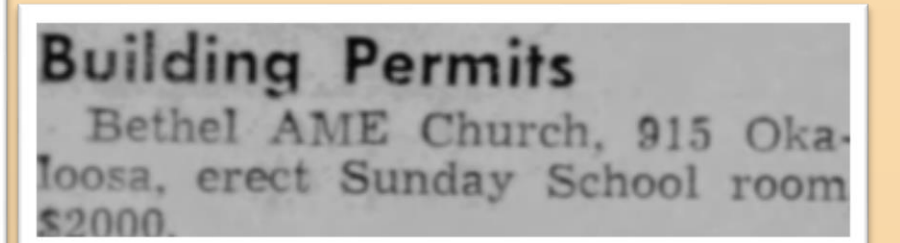
Modern view of the Sasser Memorial Fellowship Hall at Bethel A.M.E. Church and the July 25, 1955 Tampa Times publication of its building permit..