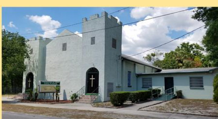
Ambassadors of Christ Temple of Prayer- Occupies the site of the original Spring Hill M.B. Church