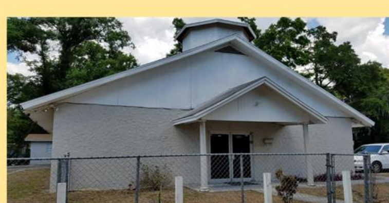
Iglesia La Verdad