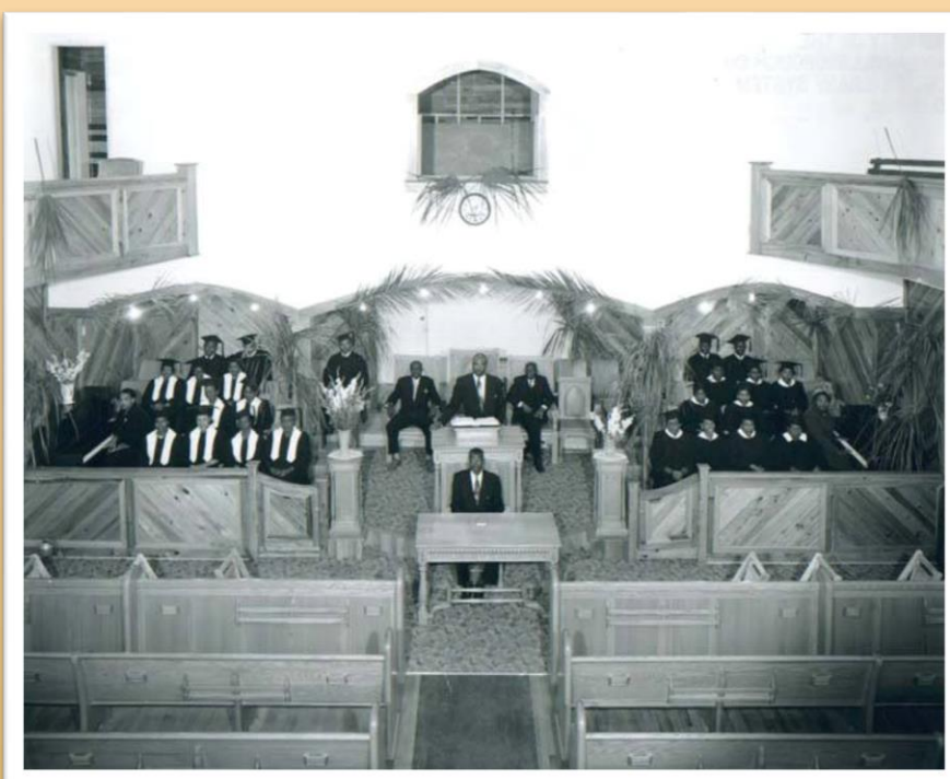
St. Matthew's Baptist Church, 1952