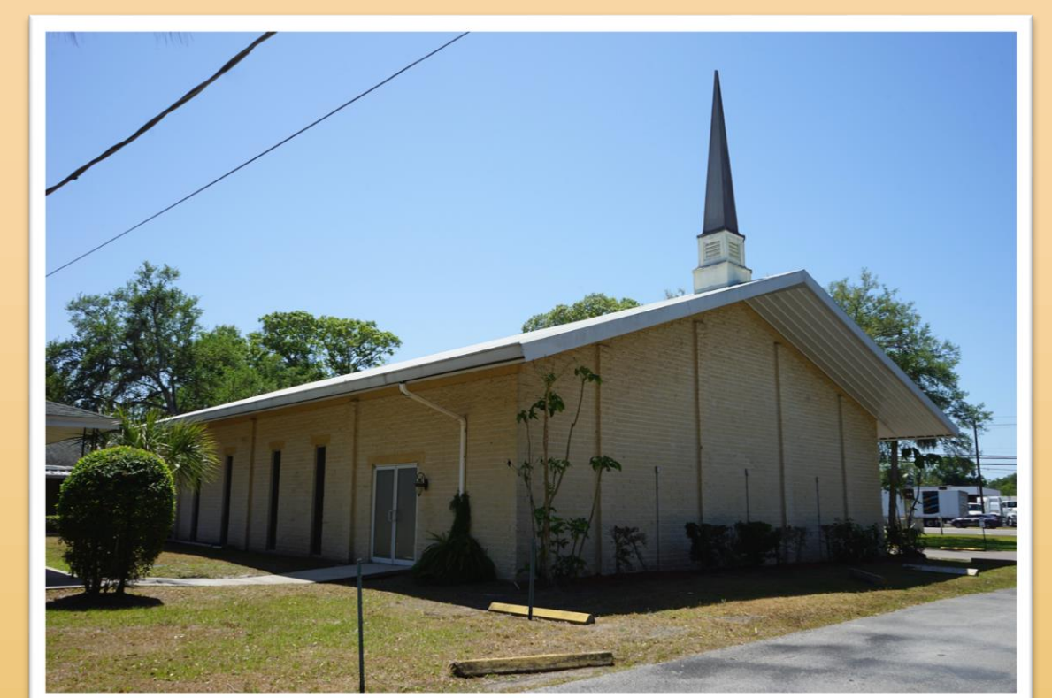
New St. Matthew's Missionary Baptist Church today.