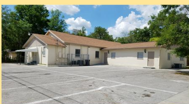
Iglesia de Dios la Hermosa - Occupies the site of the original St. Matthews M.B. Church

Today, Spring Hill is a community of many diverse faiths. Although all of the original churches except Bethel A.M.E. have moved out of Spring Hill, the community is currently home to many churches of a variety of faiths. Here are just a few: