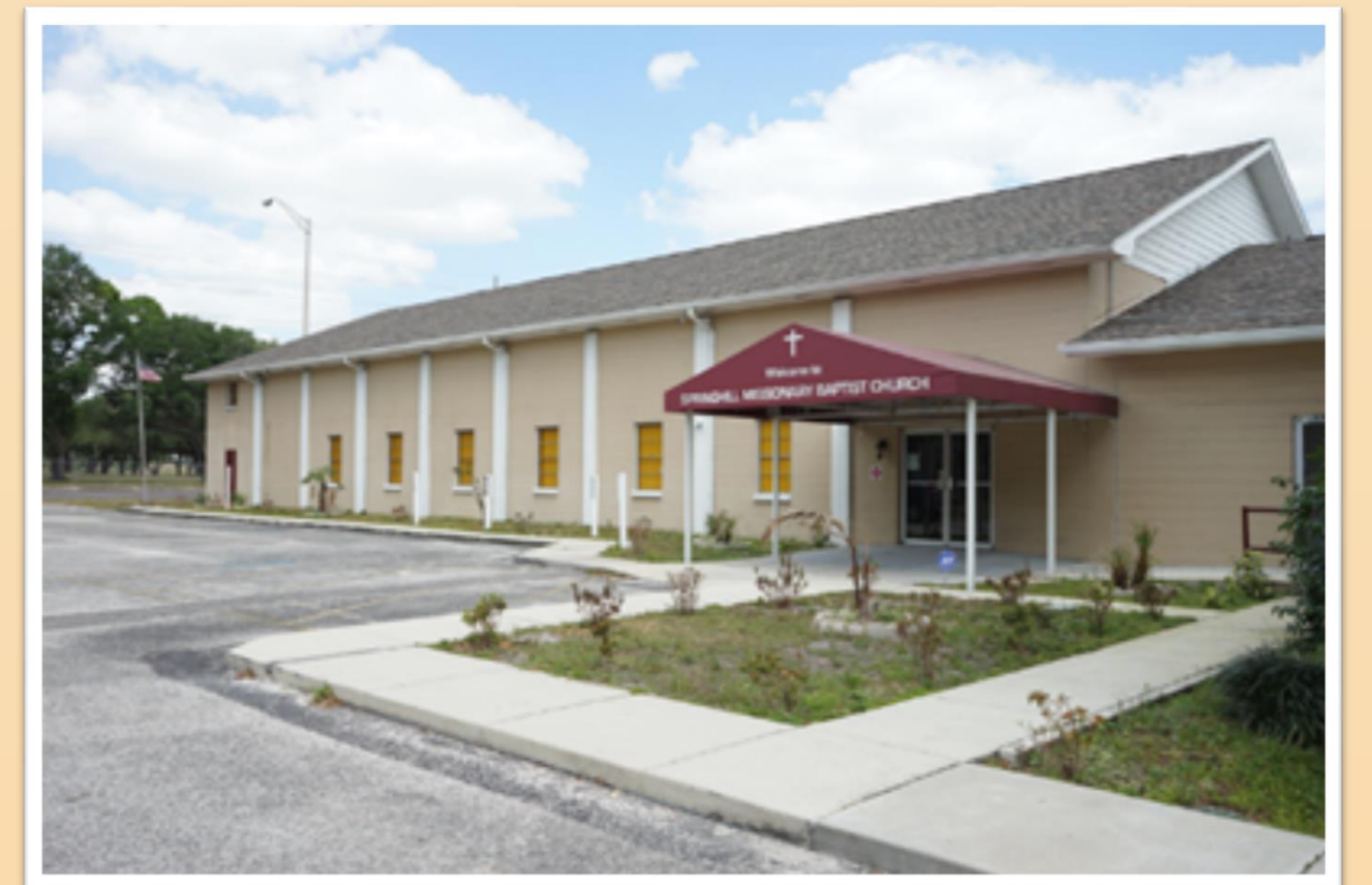
New Spring Hill Missionary Baptist Church today.