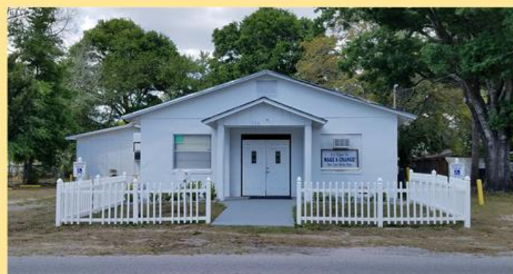
Emmanuel Church of Deliverance, Apostolic Faith, Inc.